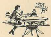
PATIO & BARBECUE

TRULINE SALES CO. DEPT. 13, P.O. BOX 1158, STUDIO CITY