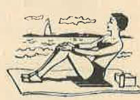
BEACH & POOL