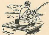
BOATING & FISHING