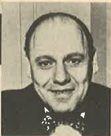
E. J. BAVASI Vice-President and Gen. Manager