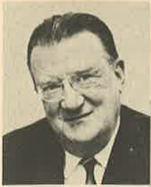
WALTER F. O'MALLEY President Los Angeles Dodgers